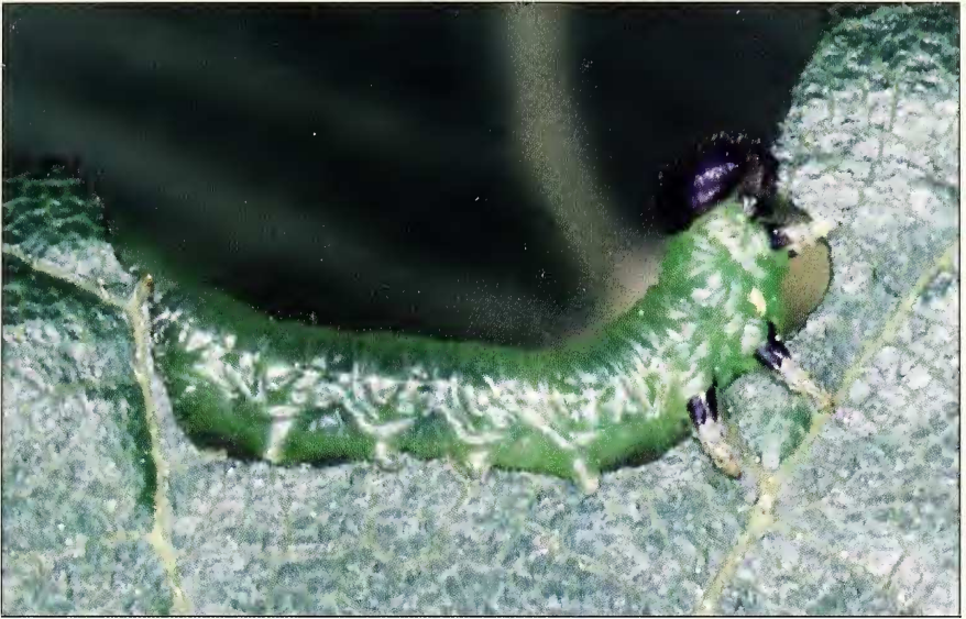
Fig. 1. A young larva of Pristiphora leucopus showing mainly black head and black coxal markings on thoracic legs